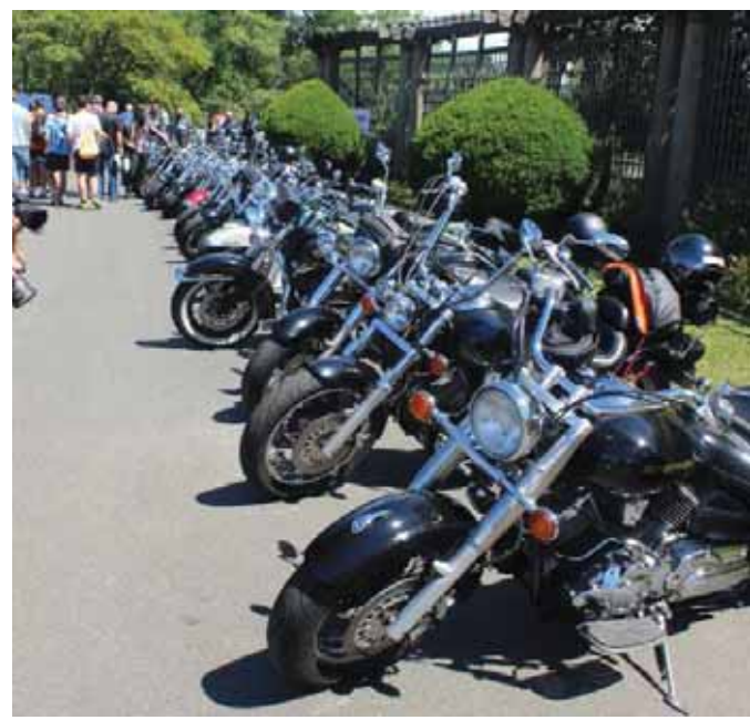
Everybody loves a cruiser!