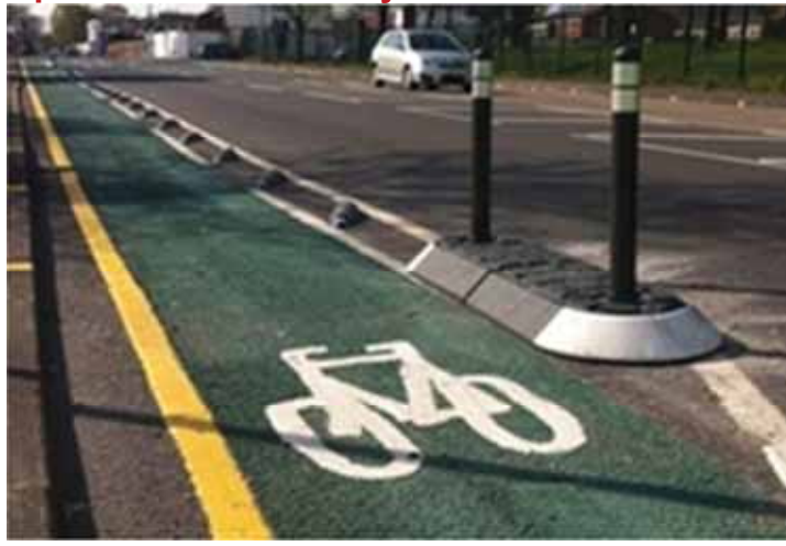
Update - Is this the way to Armadillo?

The pilot for segregated cycle lanes along Liverpool Street and Middlewood in Salford using Zicla Zebra traffic separators – known as 'armadillos' – has been run and feedback has been gathered. It is the first time they are being used in the UK outside of London. The trial is over now, but these dangerous 'armadillos' and their partners the Bollards are still there. One problem is that the cycle lane is not a full width lane - for one thing the road is two narrow. There is a reason why France, Spain & the USA have these in use – their roads are at least twice as wide as ours. Nobody seems to have thought about this.